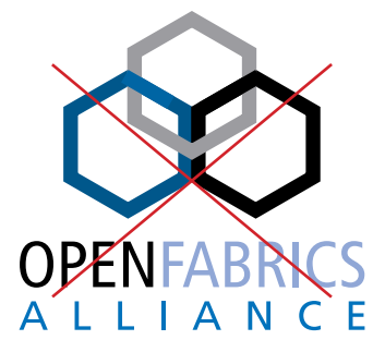
Do not rearrange the colors of the Logo or Signature.