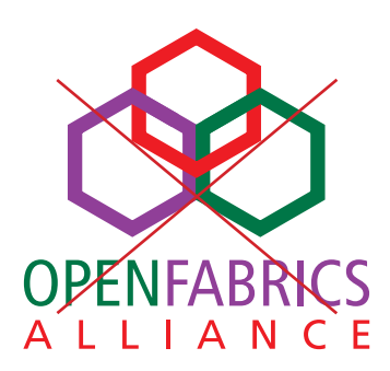
Do not change colors of the Logo or Signature.