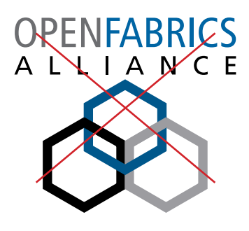
Do not rearrange or stack Logo or Signature.